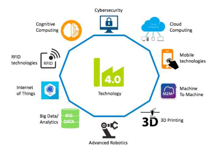
Figure 1 Industrial 4.0; Main components

achieve business and supply chain goals. This transformation can be identified as the Industry 4.0: The 4<sup>th</sup> industrial revolution. It can be further clarified as the digital transformation for implementation of cyberphysical integration concepts in manufacturing, supply chain and specially in value creation processes. Basically, it uses embedded software systems, latest control systems and get rid of an internet address in