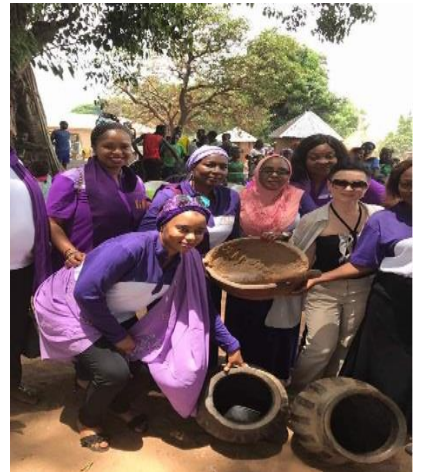
11. WiLAT Sri Lanka 5 th year Anniversary & UN HeForShe Awards Celebration | Press for Progress via Sustainable Logistics and Transport was held on March 23, 2018.