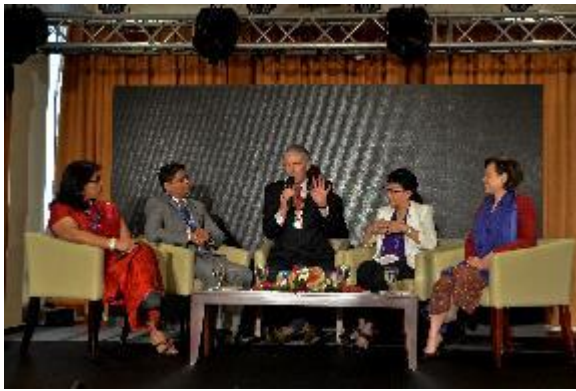
Panel discussion in action