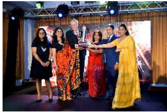
"HeForShe" IMPACT Champion John Keells Holdings PLC - Platinum award