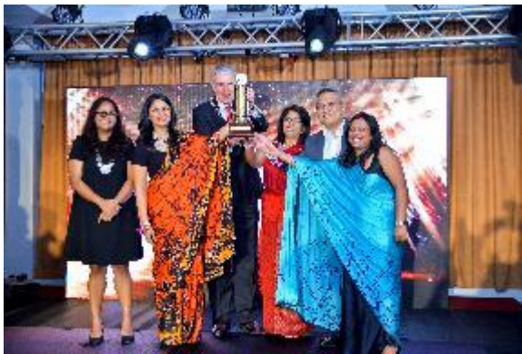
"HeForShe" IMPACT Champion Unilever Sri Lanka - Gold award