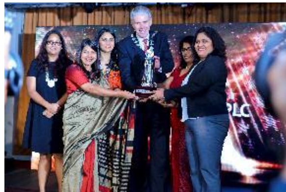
"HeForShe" IMPACT Champion McLarens Group - Silver award